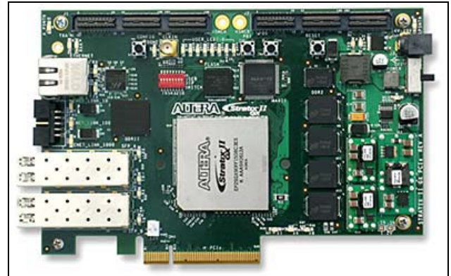
Figure 1: Prototyping / Development Board